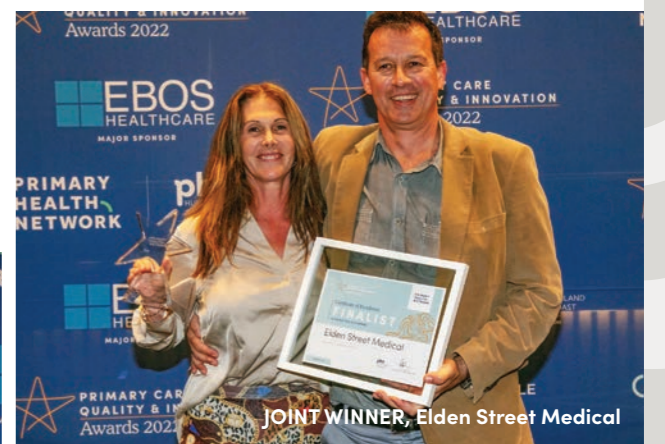
JOINT WINNER, Elden Street Medical