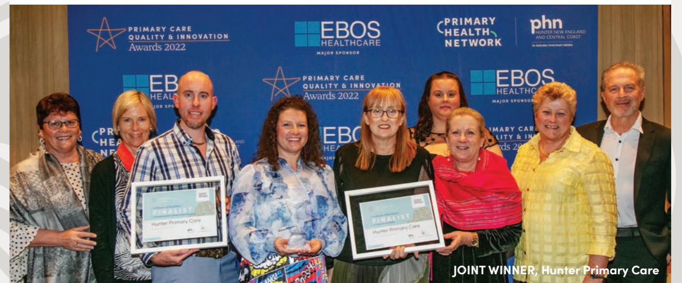
JOINT WINNER, Hunter Primary Care