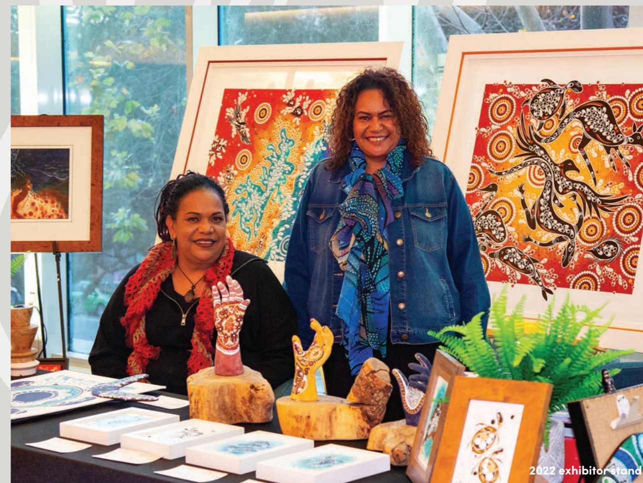
2022 exhibitor stand