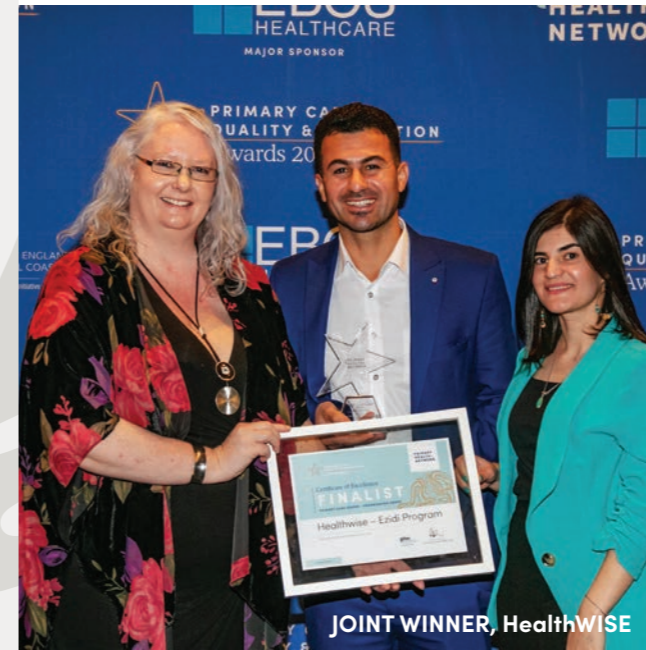
JOINT WINNER, HealthWISE