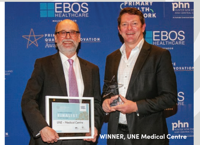
WINNER, UNE Medical Centre