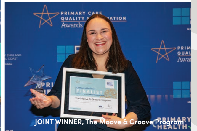
JOINT WINNER, The Moove & Groove Program