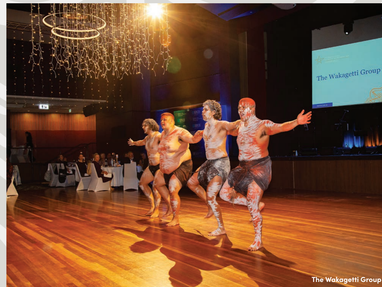
The Wakagetti Group