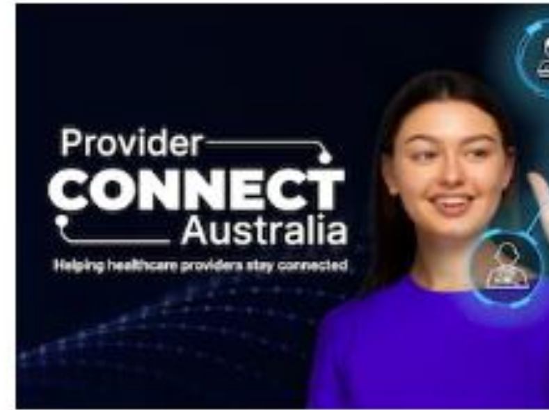
Provider Connect Australia