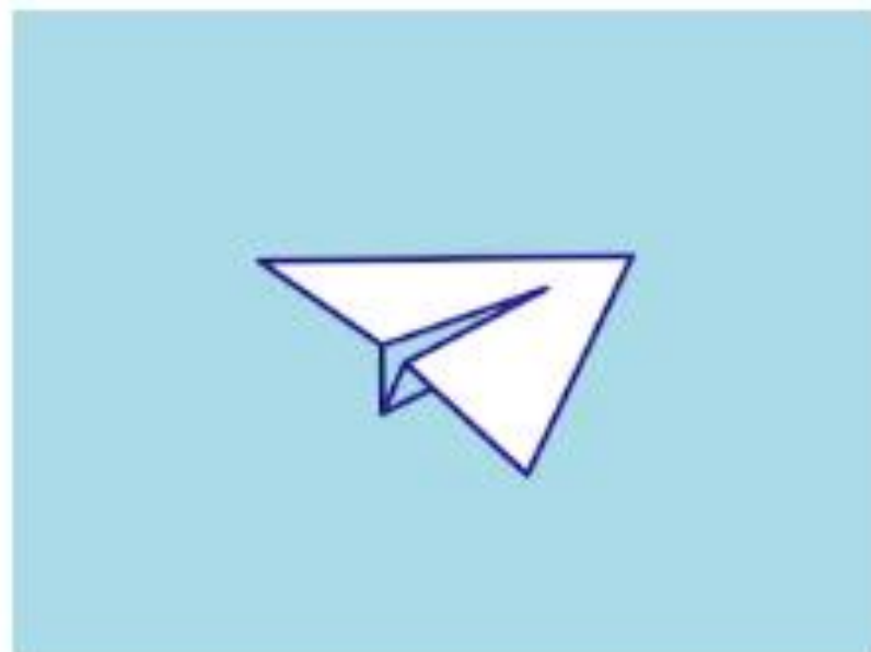
SeNT eReferral System