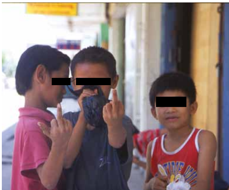
Street boys sniffing glue.

As an illicit drug, it is used for euphoria, fat reduction and muscle building. It is a clear liquid with a slightly salty taste and is short