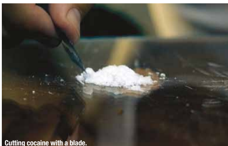
Cutting cocaine with a blade.

In the US, the majority of cocaine is used intranasally, with less than one-tenth injected. In Australian capital cities, it may be easily purchased via SMS and delivered just