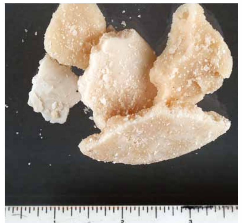
Rocks of crack cocaine.

There are no specific therapies for treating cocaine, only symptomatic treatments.