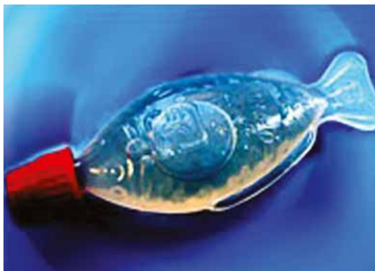
GHB in soy sauce container.